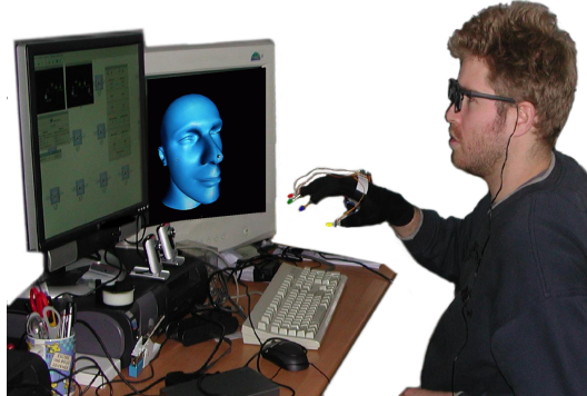
Fig. 2. User in front of the system. On the left computer, the VRPN server and the two webcam widgets with the colored LEDs detected. On the right computer, the VRPN client with the 3D rendering.

deformations to the scene. Communication between the acquisition computer and the rendering machine is done with the VRPN library [16] in order to make its integration with Virtual Reality Systems possible.