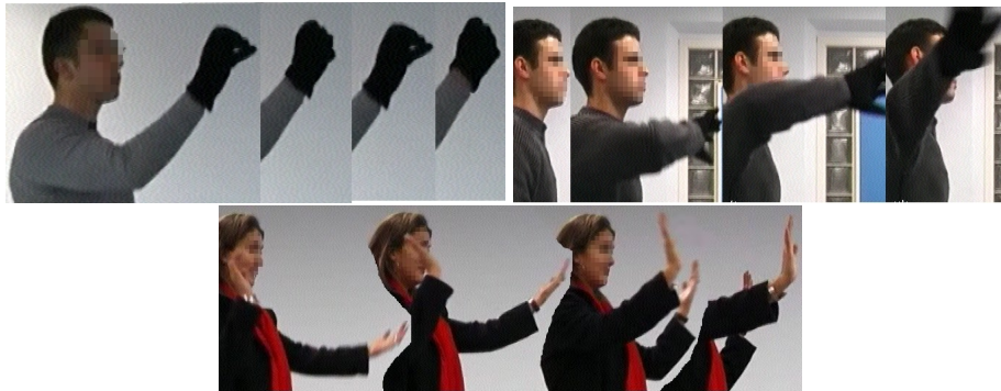
Fig. 5. Gesture for rotation: different users mean different gestures !

prototype and also to evaluate the most appropriate commands for interaction modes switching.