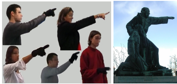
Fig. 4. Selection gesture: users agree for the same gesture !